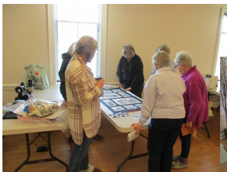
Members gather around to help a fellow quilter decide on a boarder for her quilt.