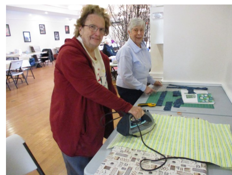
Members working on their projects.