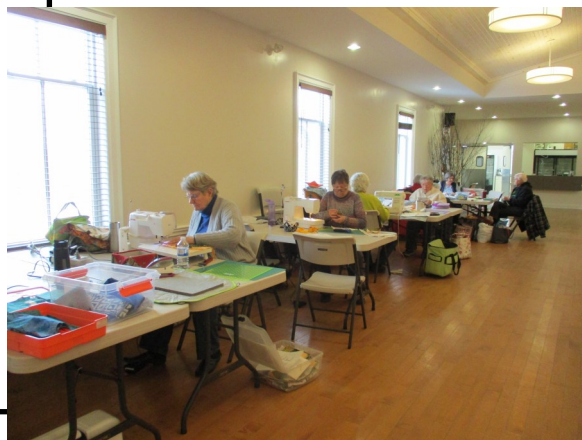
Everyone is concentrating on making perfect points and quarter inch seams.