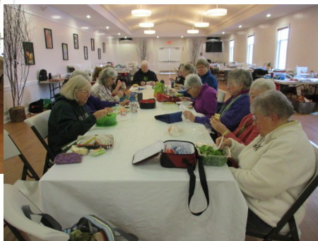
Lunch time provides an opportunity to relax and share stories.