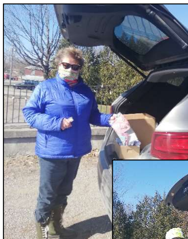
Wednesday morning mask, headbands and bag drop off