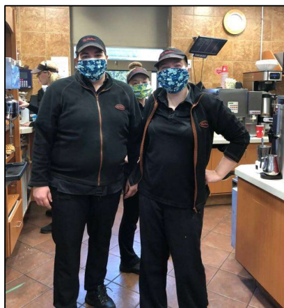
Tim Hortons staff modeling their face masks