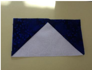
Large flying geese.